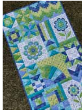
FROLIC BLOSSOM PANEL

Class fee includes your choice of panel colourway, wadding and backing. BERNINA sewing & longarm machines will be provided along with Amanda's Good Measure rulers for you to use in class.